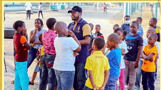
Children participating in games and having fun at the event