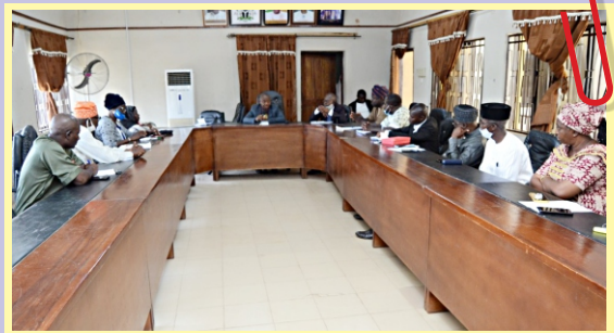
Cross section of Kwara Polytechnic and NIQS Kwara Chapter officials at the visit on 7-12-2020