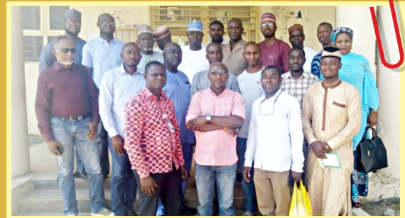
Group photograph of Chapter Chairman, Senate members, HOD QS Dept. & some lecturers