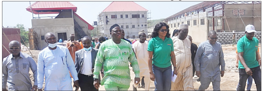
Facility tour of Halibiz industries