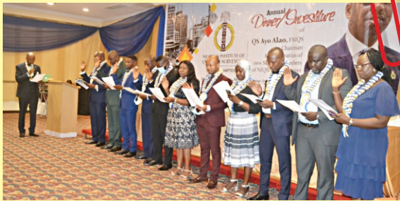
2020-2022 Senate members taking Oath of Office as administered by the Chairman