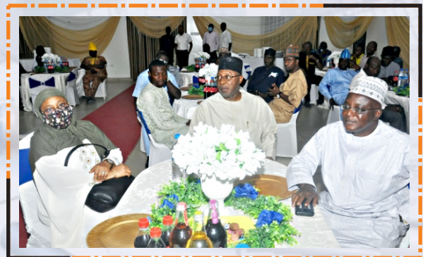
Cross section of guests including QSRBN President at the event