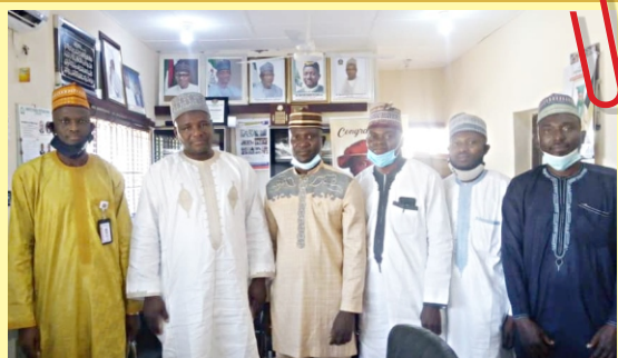
Group photograph of Senate members with the HoD QS Dept.