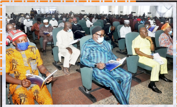
Cross section of members at the meeting