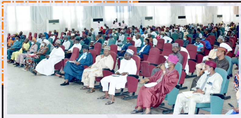
Cross section of some past presidents & BOT members at the meeting