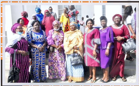
Chairperson in group photograph with other WAQSN executives