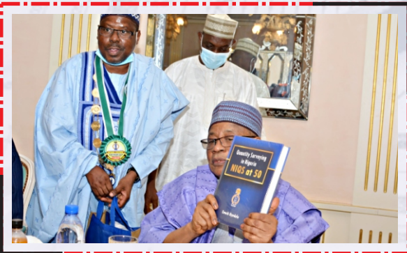
NIQS President presenting some NIQS publications to the Grand Patron