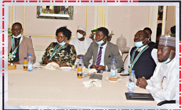
Asst. Sec. General, Treasurer, YQSF Chairman & others at the event