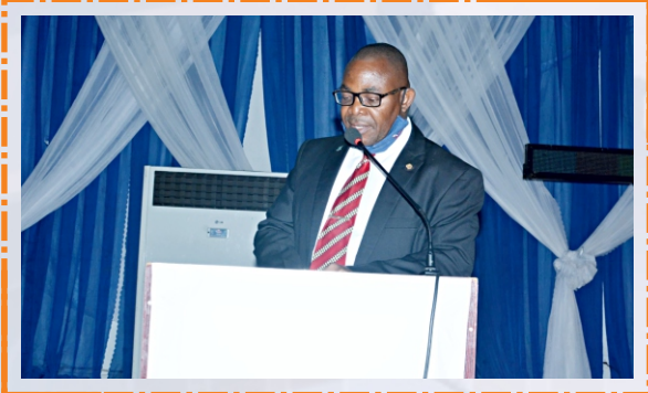
The External Auditor presenting his report at the meeting