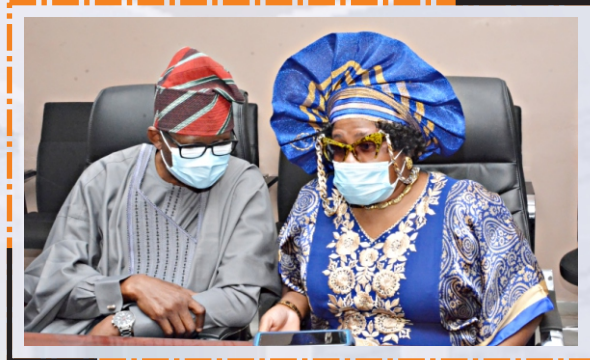
Treasurer & Sec. Marketing & Corporate Affairs at the visit