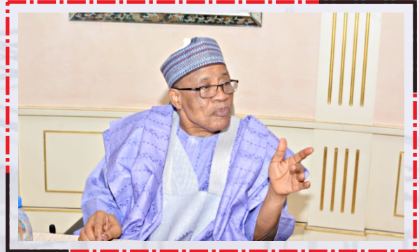
NIQS Grand Patron, Gen. Ibrahim Babangida, GCFR welcoming the guests during the visit