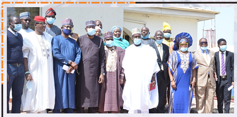
Group photograph of the SSG & his entourage with NIQS President & other NEC members after the visit