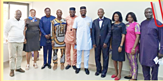
The Head of Service & Chapter Chairman in a group photograph with the NIQS & Head of service officials