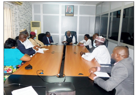
Cross section of participants at the roundtable meeting