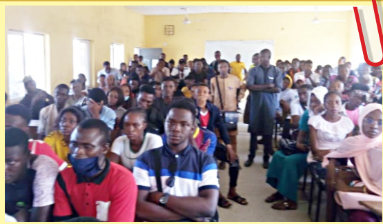
Cross section of students at the meeting