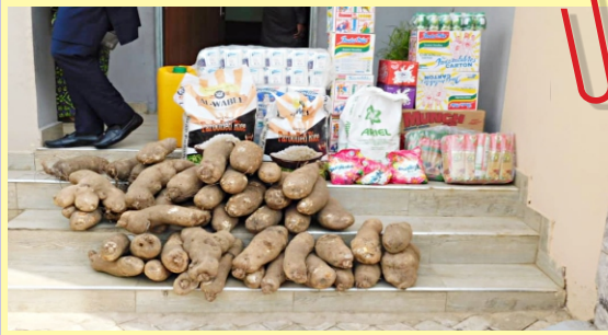
Items donated to the Children's home during the visit