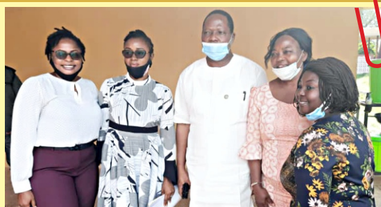
The Speaker in a group photograph with some Ogun Chapter WAQSN members