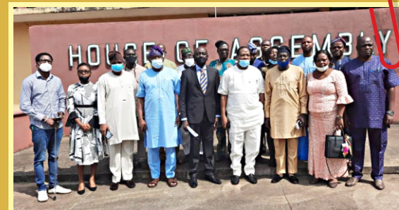
The Speaker in a group photograph with members of NIQS Ogun Chapter