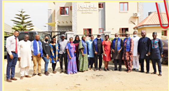
Group photograph of the FCT senate members & the management of the home