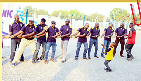
Some male members participating in tug-of-war game with the female