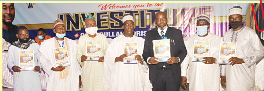
Launching of the Kaduna Chapter magazine 'QS DIGEST' by the SG and other dignitaries at the event