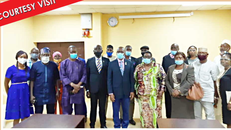
Ogun Chapter Senate on a courtesy visit to the Ogun State Commissioner for Physical Planning & Urban Development.