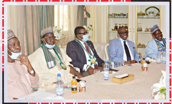
NIQS President, Deputy President, Vice President, Secretary General at the event