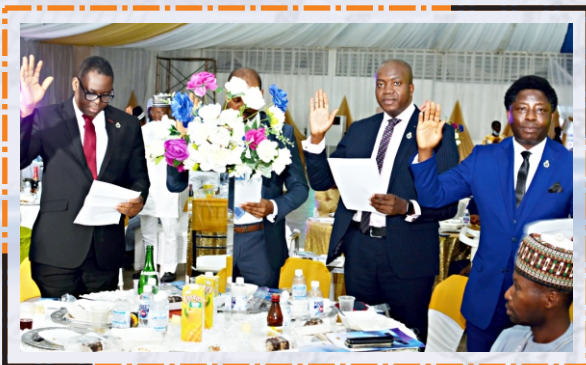
Cross section of the new Fellows taking Oath of Allegiance at the event.