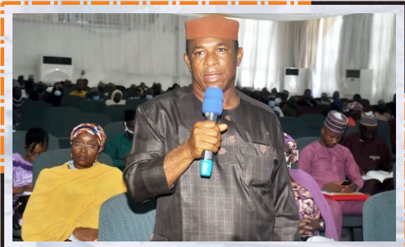
Questions being asked by a member