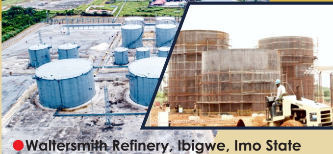
● Waltersmith Refinery, Ibigwe, Imo State

The Waltersmith Modular Refinery, developed by the Waltersmith Refining & Petrochemical Company Limited (WRPC), is located at Ibigwe Field, Ochiai Community, Ohaji-Egbema Local Government, Imo State. It was commissioned on Tuesday 24th November 2020 by President Muhammadu Buhari virtually.