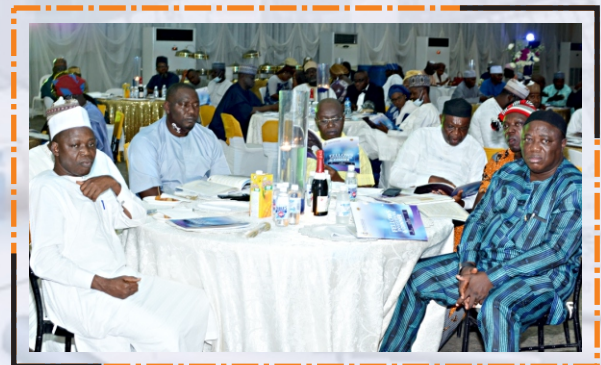
Cross section of guests and members at the event