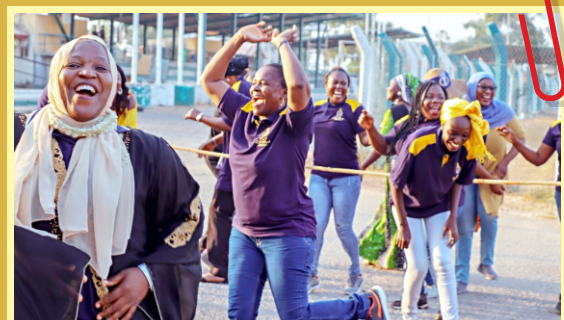
Female members rejoicing after winning the tug-of-war game