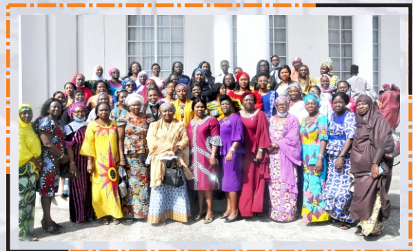
WAQSN members group photograph at the end of the meeting