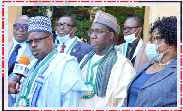
NIQS President fielding some questions from the media after the visit