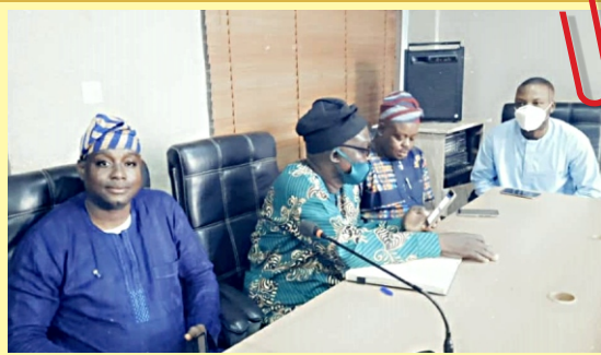
Cross section of members at the visit