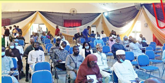
Cross section of participants at the event