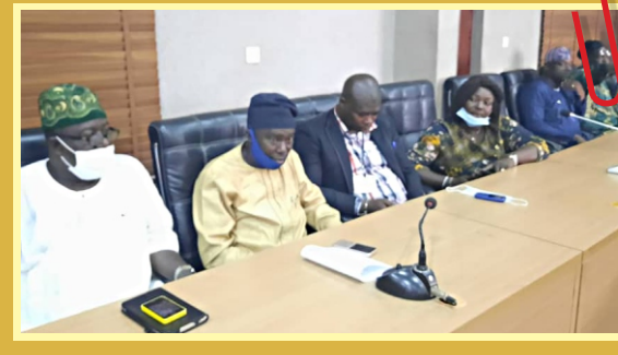
Some of the past Chairmen and other members at the visit