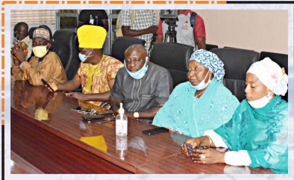
Niger Chapter Chairperson, WAQSN Chairperson others at the event