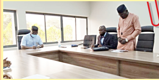
The Chairman delivering his speech during the visit