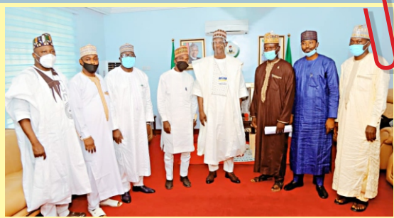
The Governor in a group photograph with State House members & NIQS Nasarawa Chapter Senate members