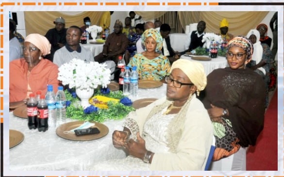
Niger Chapter Chairman with Some members at the event