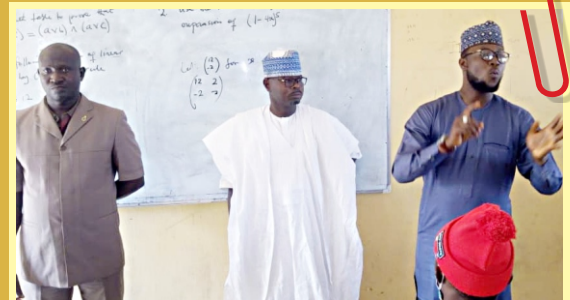
Nasarawa Chapter Chairman, HOD QS Dept. & YQSF Coordinator addressing the students at the meeting