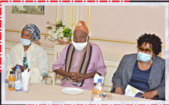
Sec. Marketing & Corporate Affairs, BOT Member & Niger Chapter Chairman, at the event