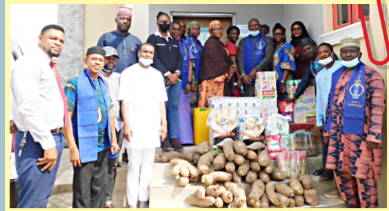
FCT senate members handing over the gift items to the management of the home