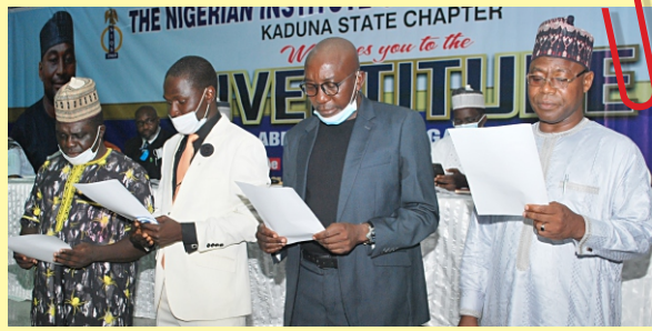
2020-2022 Senate members taking the Oath of Office