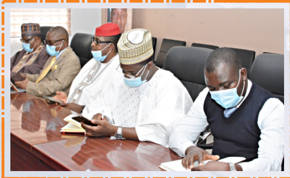
NIQS President, Deputy President, Vice President, Secretary General & Asst. Sec. General at the event