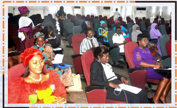
Cross section of WAQSN members at the meeting