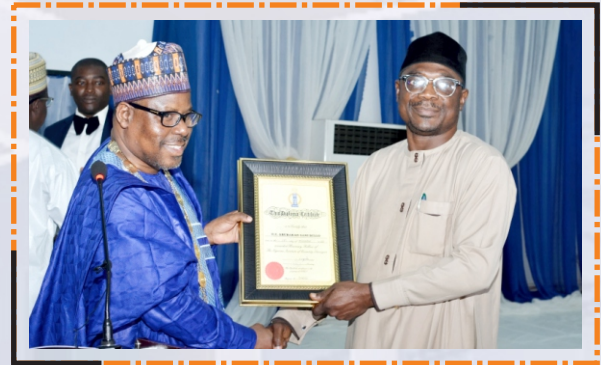
Presentation of Honorary Fellow Award to the Governor of Niger State by the NIQS President