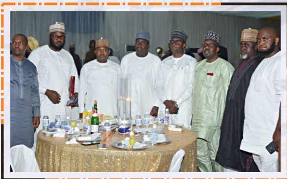
Another section of members and guests at the event