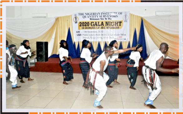
Dancers entertaining the guests at the gala night