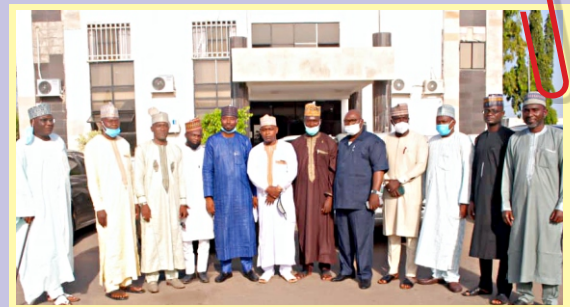
Group photograph of Nasarawa Chapter Senate members & other members