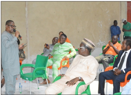
NIQS President addressing the audience during the visit