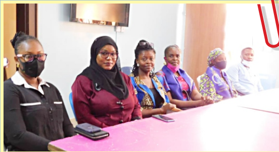
Cross section of the FCT senate members at the visit