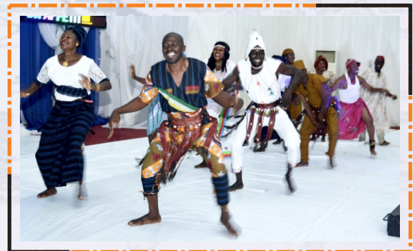
Cultural troupe entertaining the audience during the event