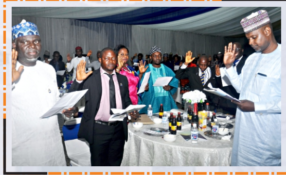
Cross section of inductees taking oath of office at the event