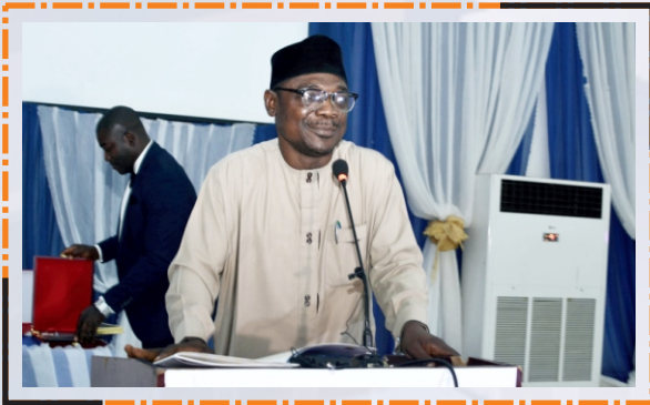
Representative of the Niger State Governor delivering the Governor's speech