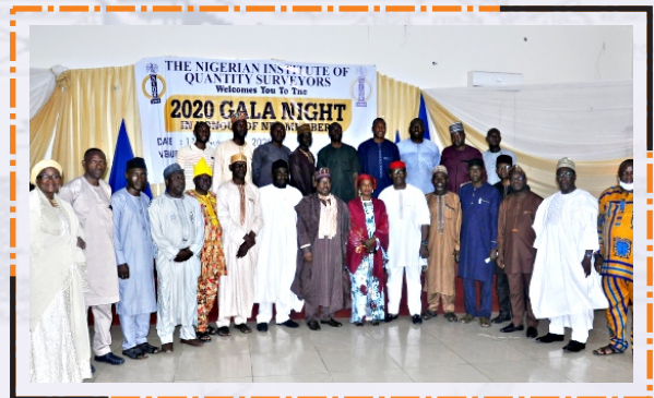
The President in a group photograph with the guests at the event.