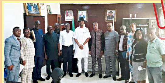
The Chairman & Commissioner in a group photograph with other Senate members, Permanent Secretary and other Directors after the meeting