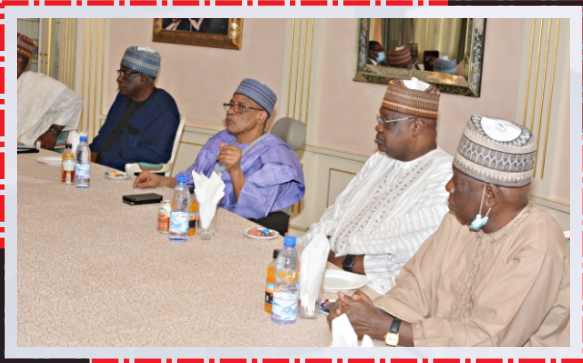
Gen. Ibrahim Babangida, GCFR and some of his former cabinet members at the event