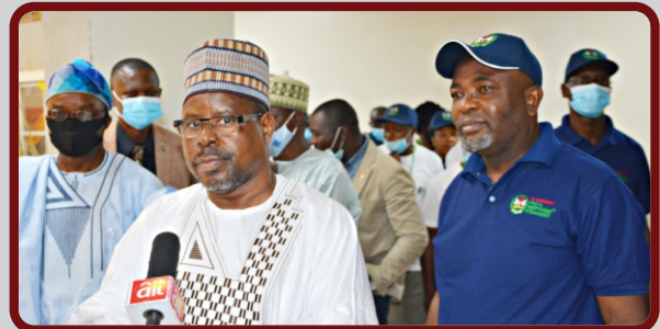
NIQS President flanked by FRC Ag. Chairman & QSA DG as he answers questions from the Pressmen