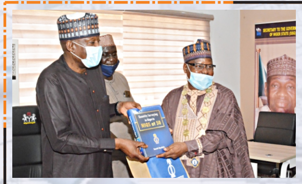
NIQS President presenting some NIQS publications to the SSG