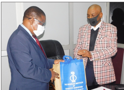
NIQS President presenting a gift bag to the Director, SCUML