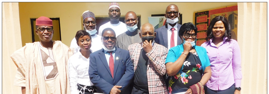
Group photograph of the management of NIQS & SCUML at the end of the visit