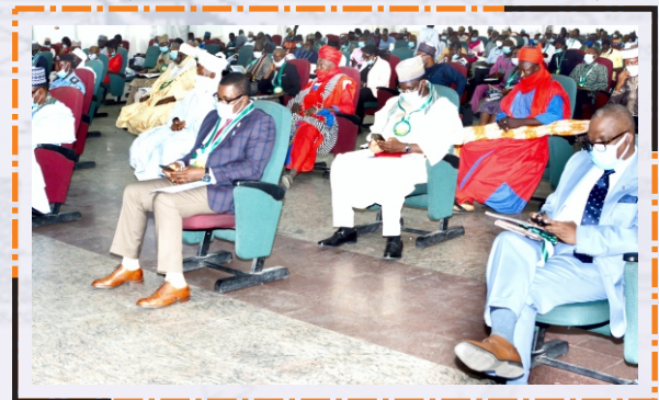
Cross section of participants at the workshop