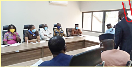
Cross section of the people present at the visit